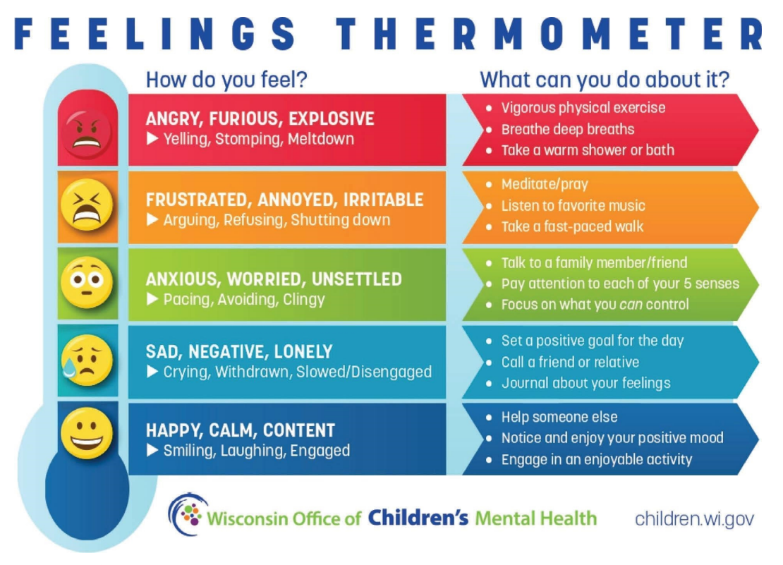
FIGURE 2: The feelings thermometer used before and after the music therapy sessions. MT = music therapy.

was ensured by providing a complete description of the theme, as well as the characteristics of the participants and examples of the children's statements and expressions [46].