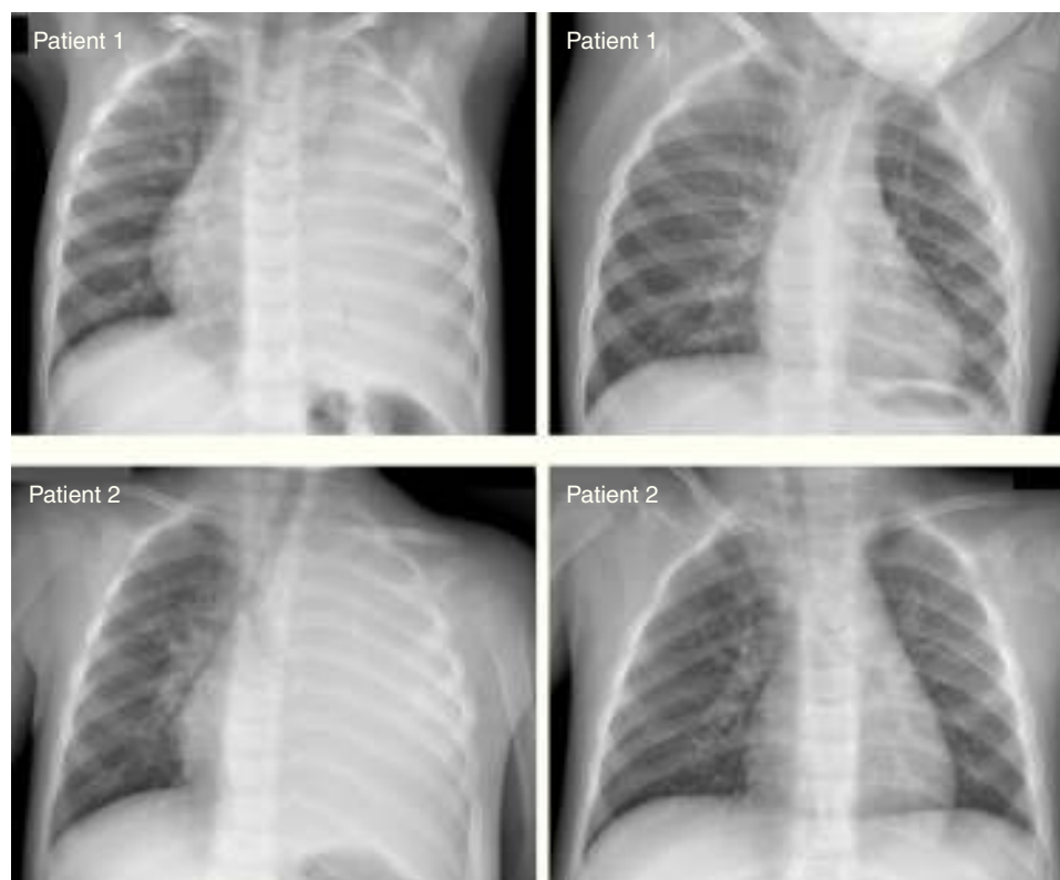
Figure 2 Initial and last chest X-ray of two representative patients with a very large complicated pleural effusion not drained. The time elapsed between the two images of each patient was (as usual in most of our cases) about 3 months.

and the time to defervescence after admission ranged from 0 to 21 days. Fever reappeared after defervescence during hospital stay in 22 patients after an apyretic period of 1–8 days, and the new fever lasted 1–12 days. There were no differences between groups in the total number of days with fever during admission (mean 7.7 days) and the total number of days from admission to complete disappearance of fever (mean 8.4 days). Only one patient presented pneumothorax before chest tube insertion. The mean LHS was longer in children with pneumothorax (18.0 vs. 10.6 days, P < 0.001 ), even when only drained patients were analyzed (18.0 vs. 12.1 days, P < 0.001 ). Although long-term outcomes were not systematically registered, all patients recovered and no permanent damage was observed on follow-up. Fig. 2 shows the initial and last chest X-ray